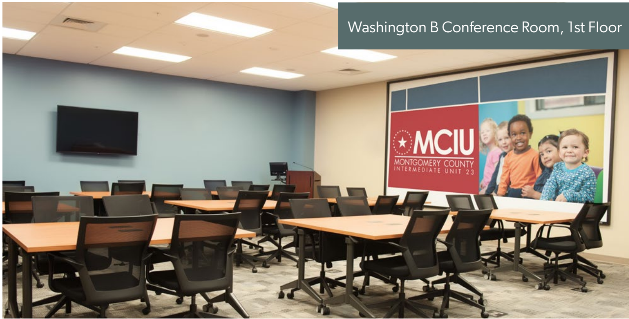
Washington B Conference Room, 1st Floor

Conference Center Facilitator | cclemens@mciu.org | 610-755-9312