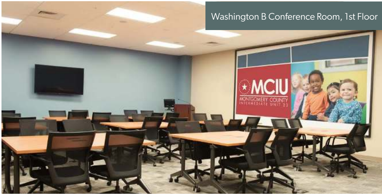
Washington B Conference Room, 1st Floor

Program Administrator of Operations | bbedu@mciu.org | 610-755-9461